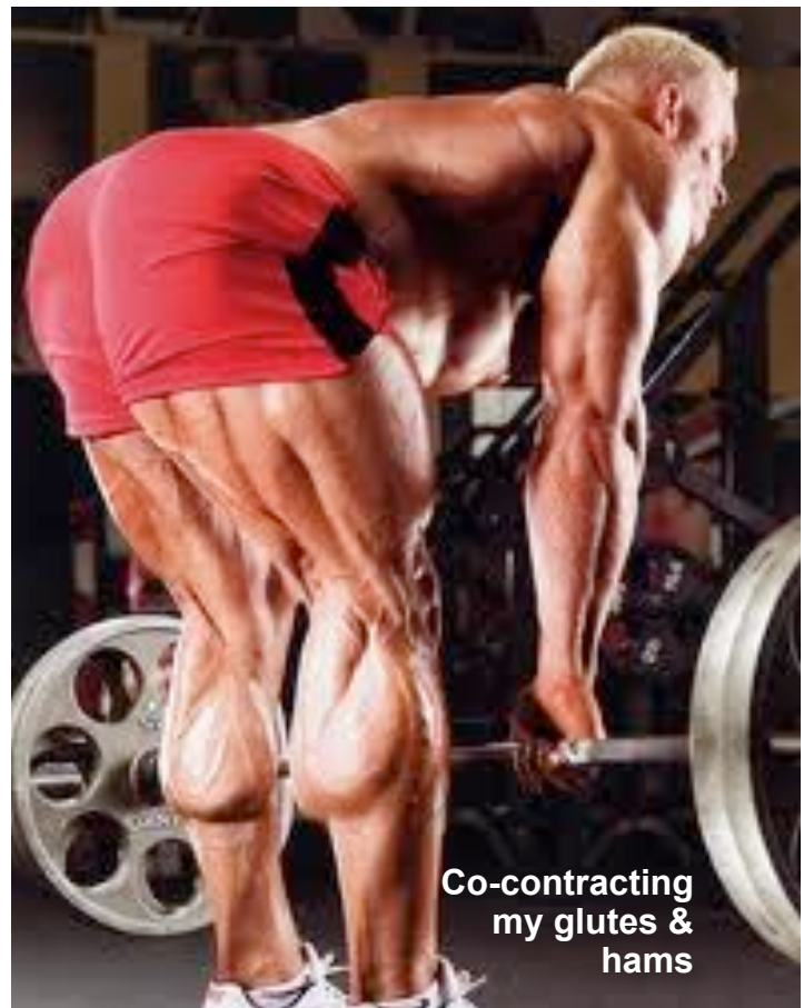
Co-contracting my glutes & hams